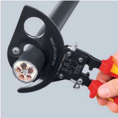
Ratchet principle and two-stage ratchet drive for easier cutting